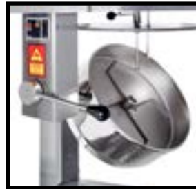
Mach 5 Kettle