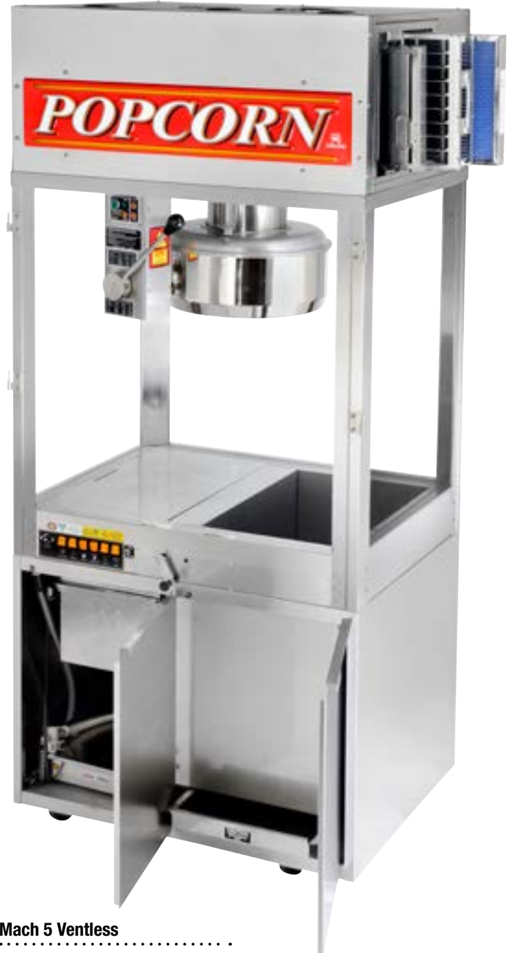
Mach 5 Ventless