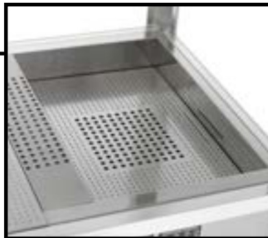
Bin Elevator (up)